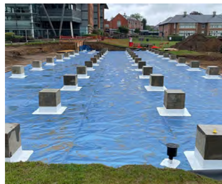
Solco, Unit 51, Portmanmoor Road Industrial Estate, Ocean Park, Cardiff, CF24 5HB