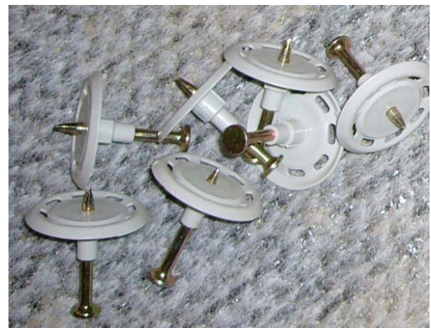
Soft Washer Fixings