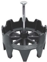
Excenter hollow with nail