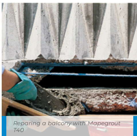
Repairing a balcony with Mapegrout T40